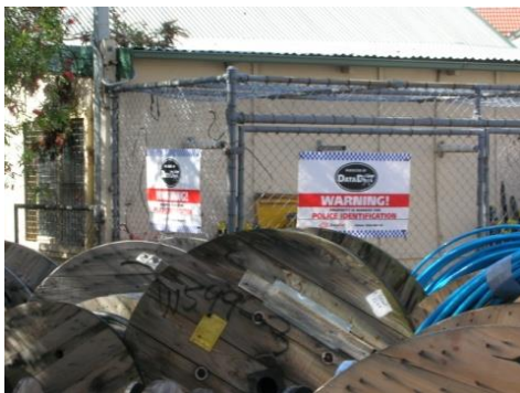
Internal Storage Yard