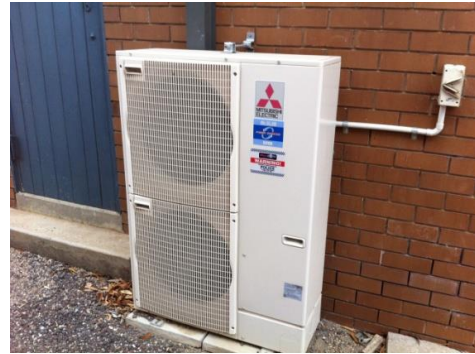
Air Conditioning Unit